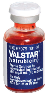
VALSTAR Intravesical Therapy

Company: Endo Pharmaceuticals Rx Pharmacologic Class: Anthracycline Active Ingredient: Valrubicin 40 mg/mL in 50% polyoxyl castor oil/50% dehydrated alcohol, USP. Indication: Intravesical therapy of BCG-refractory carcinoma in situ (CIS) of the urinary bladder in patients for whom immediate cystectomy would be associated with unacceptable morbidity or mortality. Dosage and Administration: 800 mg intravesically once weekly for 6 weeks. Retain in bladder for 2 hours before voiding. Maintain adequate hydration. Adverse Reactions: Local: urinary frequency, urinary urgency, dysuria; Systemic: UTI, abdominal pain, nausea, asthenia, headache, malaise, urinary retention.